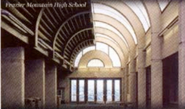
Frazier Mountain High School